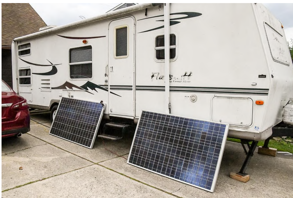
Solar Panels used for the Alternate Power QSO's

In accordance with the 2020 Field Day rules for bonus points (section 7.3.8), SJRA claims 100 bonus points for completing the five solar power QSOs.