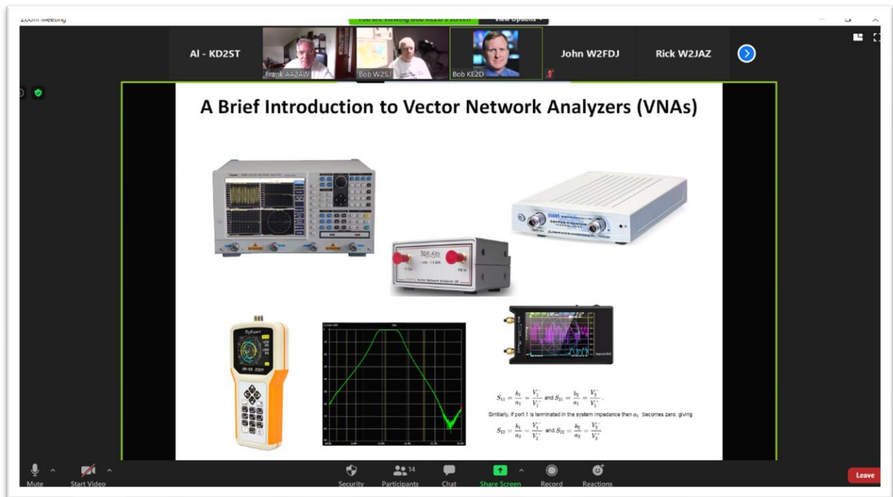
Screen shot of Educational Presentation on VNA's via zoom virtual meeting.